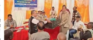
किसानों को उपकरण वितरण के लिए सहायक प्रशासन के अधिकारी के साथ किसानों के साथ।

नव जागृति संस्था द्वारा संचालित समग्र ग्राम विकास कार्यक्रम परियोजना सहायकी एच.डी.एफ.सी. बैंक परिवर्तन सौकरा में माध्यम से गण लित के बेरोजगार कर्मी के लिए पंचायत प्रशासन के तहत 50 प्रगतिशील किसानों को मिला उपकरण।