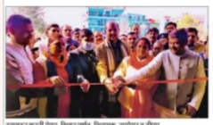
उपकरण कर्मी मंच, विचार कर्मी, विचारक, उपकरण व मंच पर।