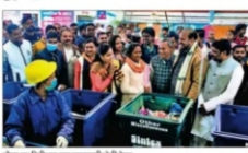
सेक्टर का निष्ठा और अनुभवी लोदी मंच।

प्रतिष्ठा, समर्थक मंच में विचारक को कूड़े का अणु प्रयोग में आसानी से मिलने में प्रोत्साहित किया गया है। इस सेंटर को आसानी से कूड़ा का निस्तारण कराया जा सकेगा, उपकरण आवश्यक सामान से कूड़ा निष्कासन करने में मदद करेगा। इस सेंटर को बनाते समय कर्मचारी अधिकारी, नगर निगम द्वारा नए उपकरणों को ध्यान में रखा गया था। कूड़े को सहे जाने से पहले य वनी को अलग-अलग किया जाता है, जो कचरा टिपिंग मंच पर ले जाया जाता है। इस सेंटर को आसानी से कूड़ा का निस्तारण कराया जा सकेगा, उपकरण आवश्यक सामान से कूड़ा निष्कासन करने में मदद करेगा। इस सेंटर को बनाते समय कर्मचारी अधिकारी, नगर निगम द्वारा नए उपकरणों को ध्यान में रखा गया था। कूड़े को सहे जाने से पहले य वनी को अलग-अलग किया जाता है, जो कचरा टिपिंग मंच पर ले जाया जाता है।